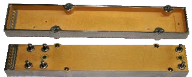
Fully integrated composite packages.

Titanium is an ideal material for electronic packages, even though it has low thermal dissipation characteristics. By utilizing our titanium composite packaging technology (incorporating Mo/Cu or AlSiC composite heat sinks) that characteristic becomes a non-issue. During the initial design phase, the electronic circuitry is mapped against the housing floor where hot spots are readily identified. The Mo/Cu or AlSiC composite heat sinks are then metallurgically bonded only at the locations where the housing comes into contact with the high-power devices. This limited use of the heat sink material minimizes the overall mass of the package.