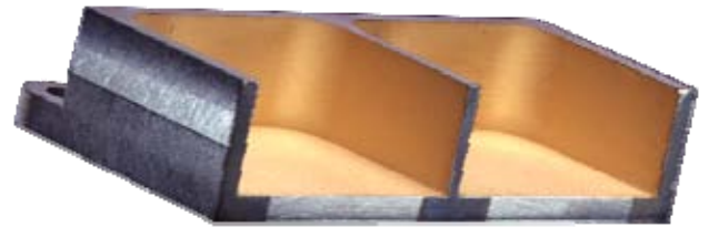
Cross-section of composite package.

Over the past decade, SOURIAU PA&E has been providing customers with the most advanced hermetic connector and packaging technologies available. With the introduction of its new titanium composite packaging, this trend continues. The new technology uses titanium as the primary housing material and integrates composite heatsinks composed of molybdenum/copper (Mo/Cu) or aluminum/silicon carbide (AlSiC) into strategic locations of the structure for excellent heat dissipation capabilities. The combination of titanium and Mo/Cu or AlSiC is ideal for achieving lightweight, low-coefficient of thermal expansion (CTE), and high-thermal-conductivity electronic packages. Electrical feedthru pins can be hermetically sealed directly into the titanium using SOURIAU PA&E's proprietary Kryoflex ® ceramic. Alternately, hermetic connectors made from explosively bonded dissimilar metals can be laser welded into position.