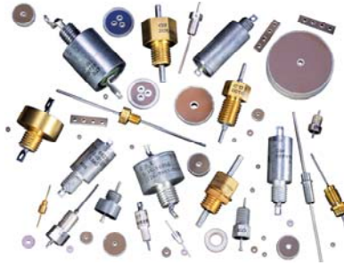
A wide variety of EMI/RFI solutions