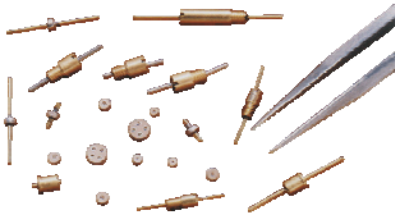
Single- and multi-pin EMI/RFI filters